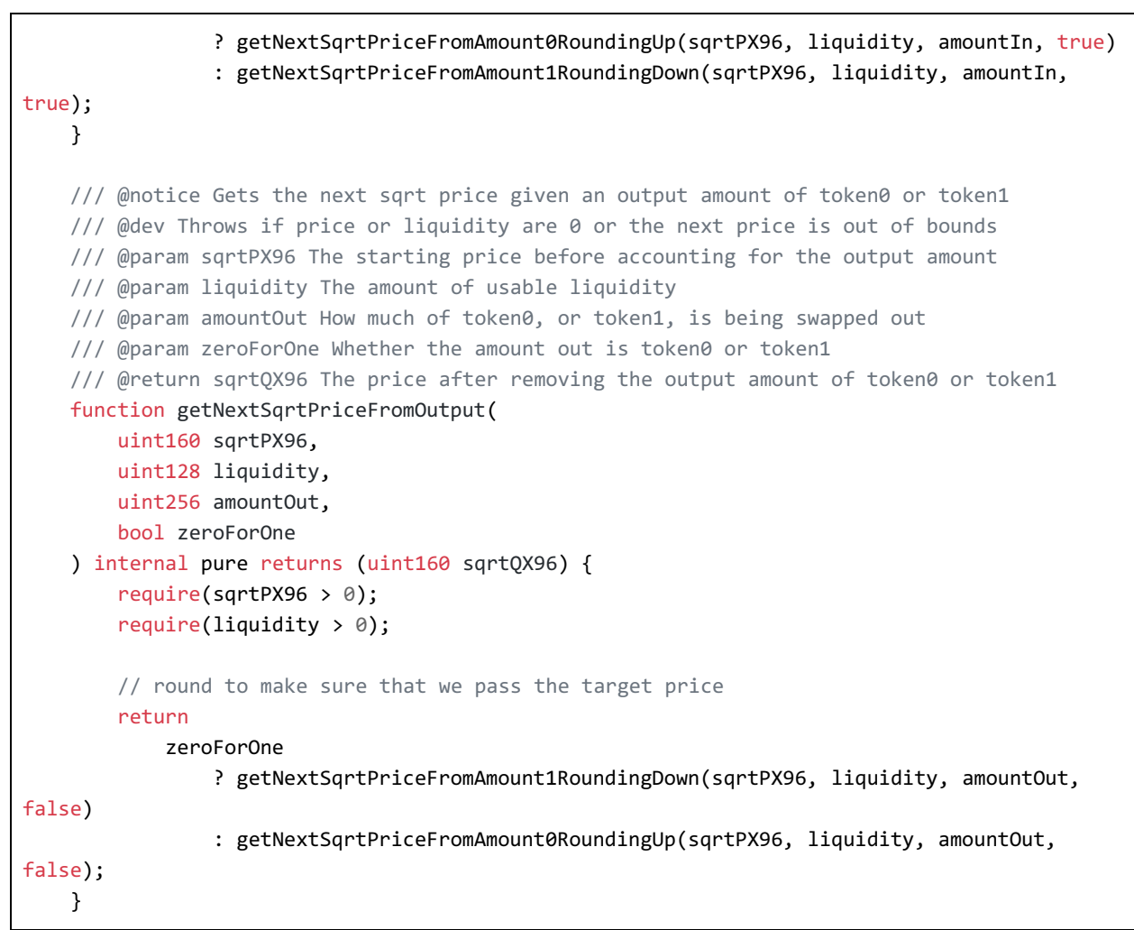
Figure 10.1: Libraries/SqrtPriceMath.sol#L102-L146

Both functions allow the next square ratio to be outside of its expected bounds.